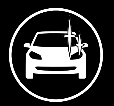
Keep your car looking new