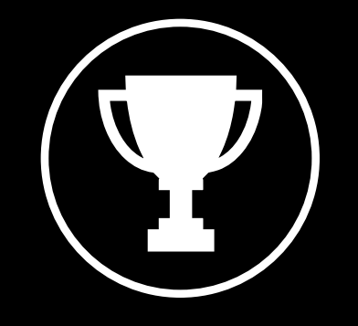
Award winning service