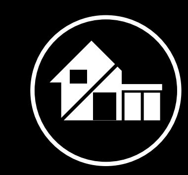
Repairs at home or office