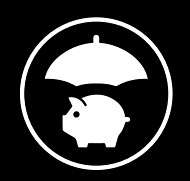
No claims protection